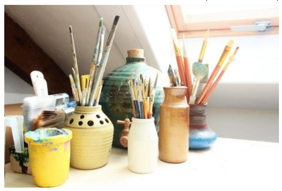
The Feminist Art Movement