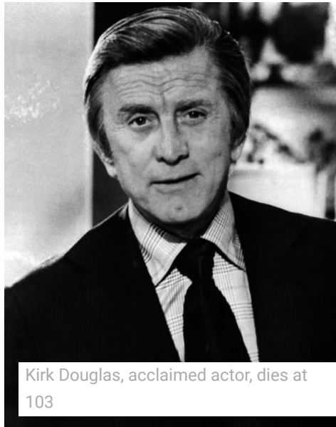
Kirk Douglas, acclaimed actor, dies at 103

Contributing Writer Telegraph Local | See My Website